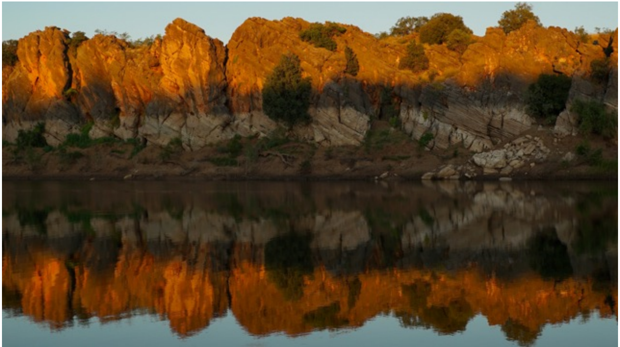
Geike Gorge on the Fitzroy River