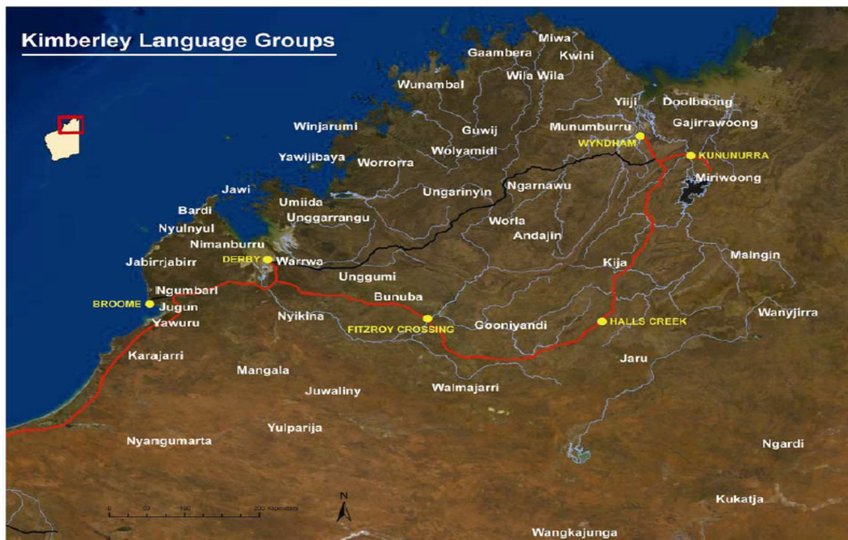
Kimberley language groups (Kimberley Language Resource Centre)

The Kimberley region of North Western Australia covers an area of 420,000 km 2 and is recognised as one of the world's most ecologically diverse areas, with one of the last pristine coastlines left on Earth. 75 per cent of long-term residents are Indigenous, from 34 different language groups (or nations), which comprise the oldest surviving culture in the world. Their stories and ecological knowledge are recorded in tens-of-thousands of rock art sites dotted across the dramatic Kimberley landscape. Approximately half the Indigenous population now lives in 200 remote Aboriginal communities varying in size from 20 to 900 people.