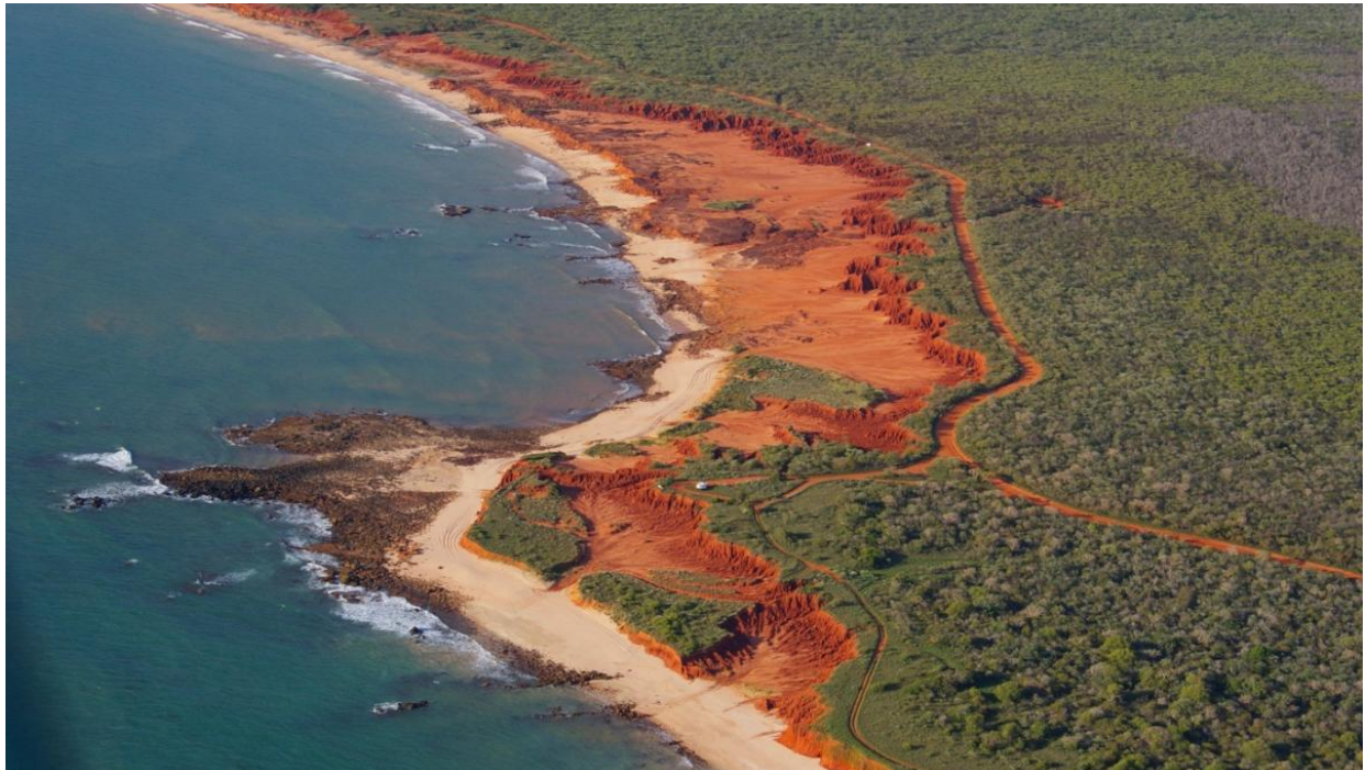
Walmadany, or James Price Point

The Kimberley is an epic and dramatic place, making this film a truly cinematic documentary. We spend time getting to know our characters on Country, hearing the stories which make the landscape such a unique cultural asset, and we dig deeper into the political machinations behind successive waves of policy which have been disadvantaging Aboriginal people since colonisation. This is a complex and urgent story which demands the attention of all Australians and indeed the world.